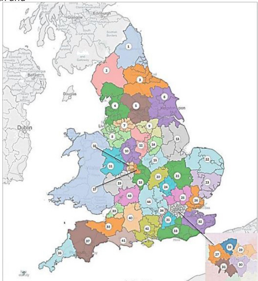
Map of STP footprints

Footprints are ‘locally defined’ and ‘based on natural communities’ with ‘existing working relations [and] patient flows’ - they are not statutory but collaborative boundaries and will not cover every planning eventuality, ‘as with current arrangements for planning and delivery, there are layers of plans which sit above and below STPs’.