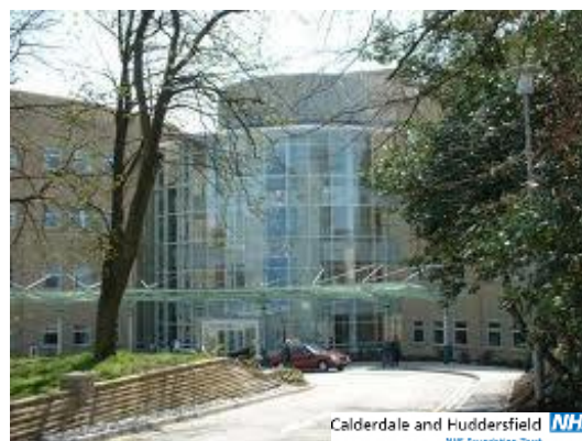
Calderdale and Huddersfield NHS Foundation Trust